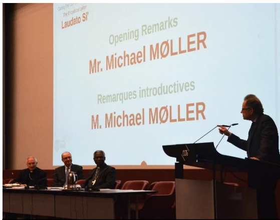
High Level Conference Laudato Si: Caring for Our Common Home, Geneva, January 2016