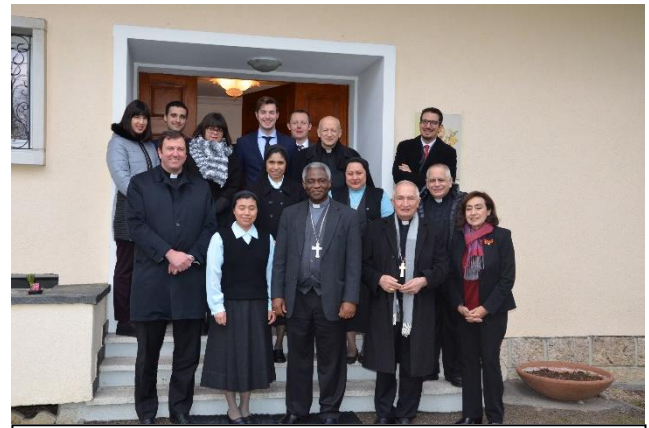
Cardinal Peter Turkson at the Holy See Mission in Geneva