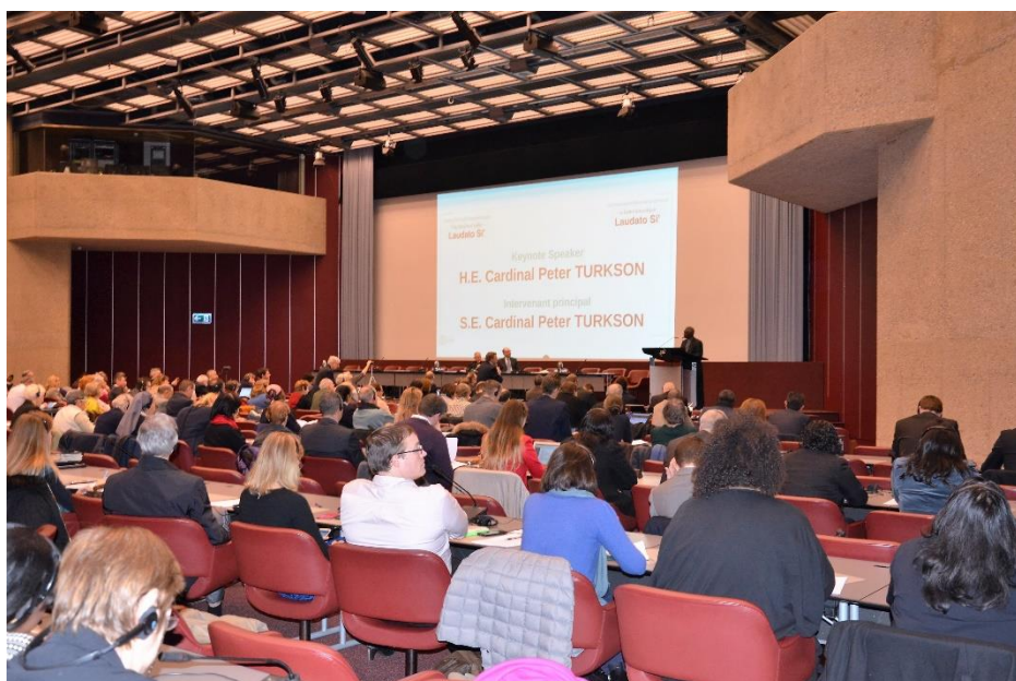
High Level Conference Laudato Si: Caring for Our Common Home, Geneva, January 2016

Furthermore, during the HRC, a closed movie session will be organized "on the Smallest Army in the World: The Swiss Guard", at the Palais des Nations, on March 3, 2016.