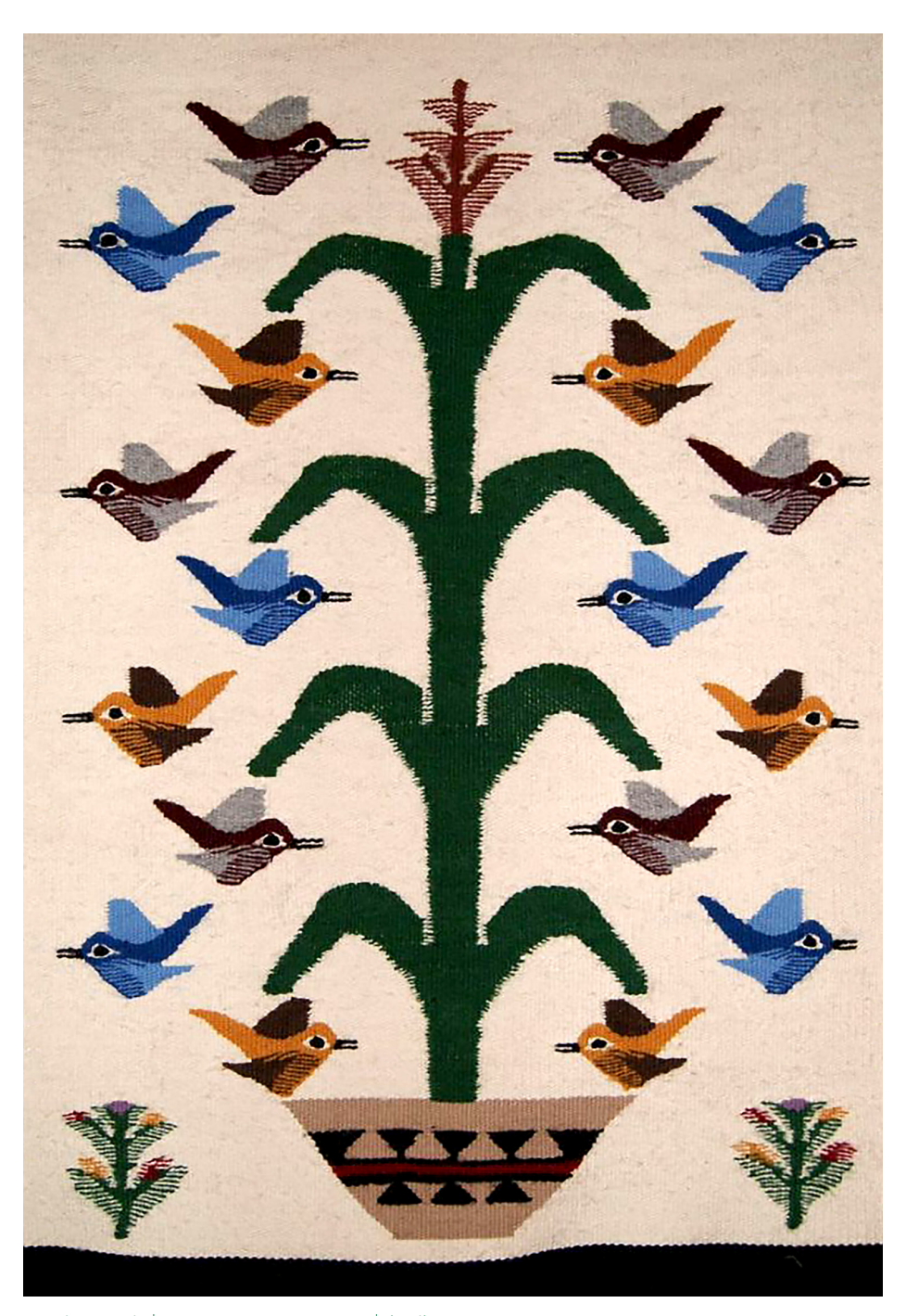
Weaving Navajo | TREE OF LIFE WITH 18 BIRDS | detail