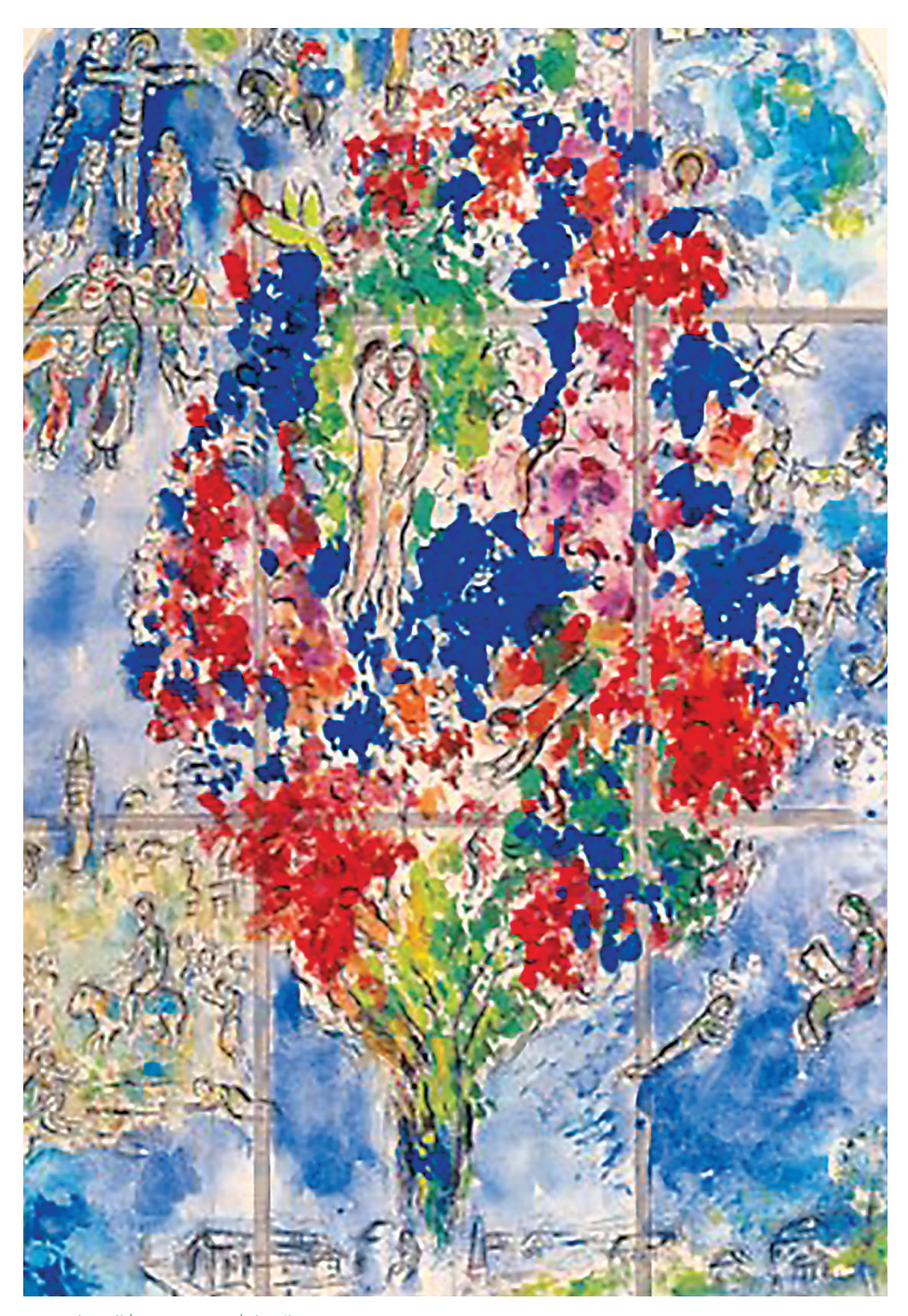
Marc Chagall | Tree of Life | detail