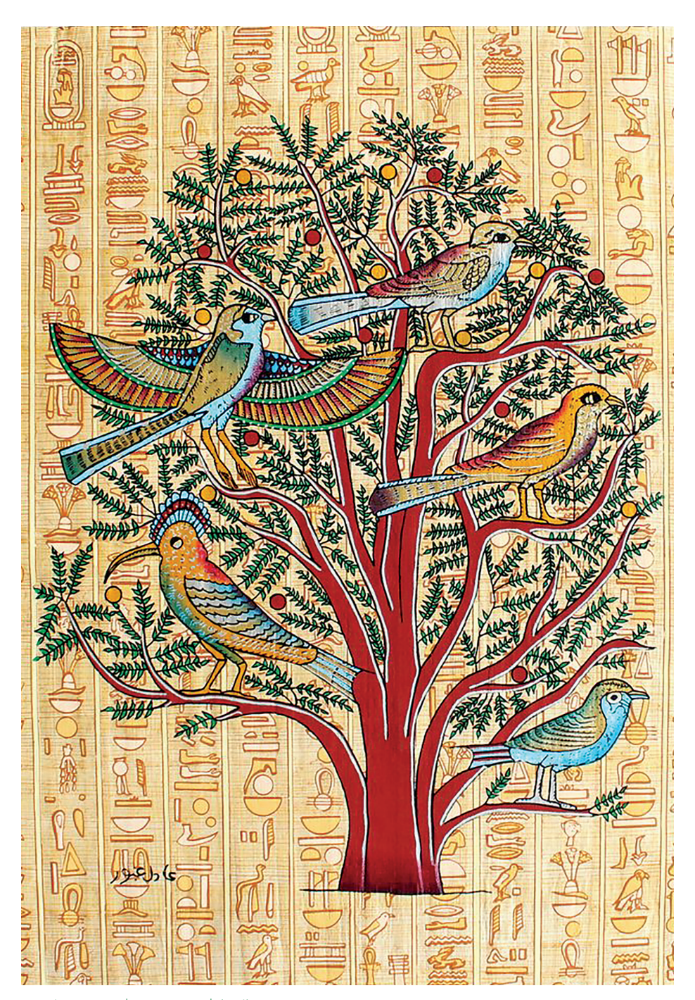
Egyptian Papyrus | TREE of LIFE | detail